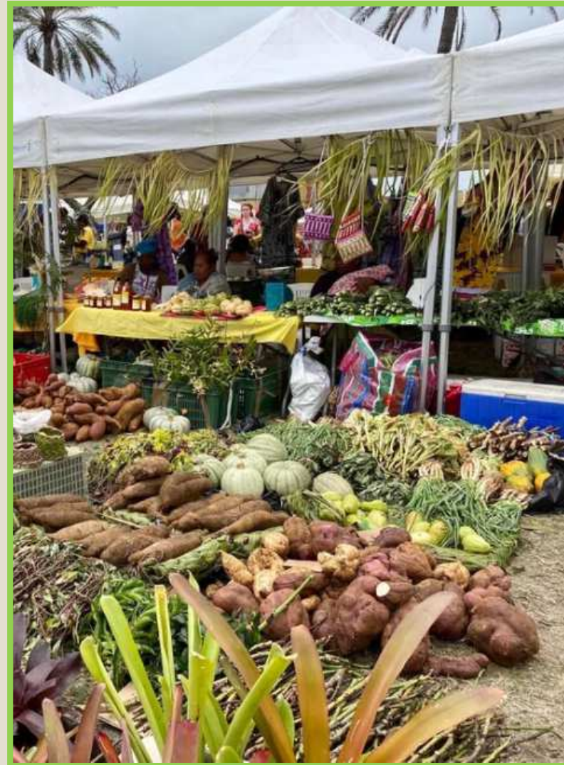
Loyalty Islands exhibition, August 2020